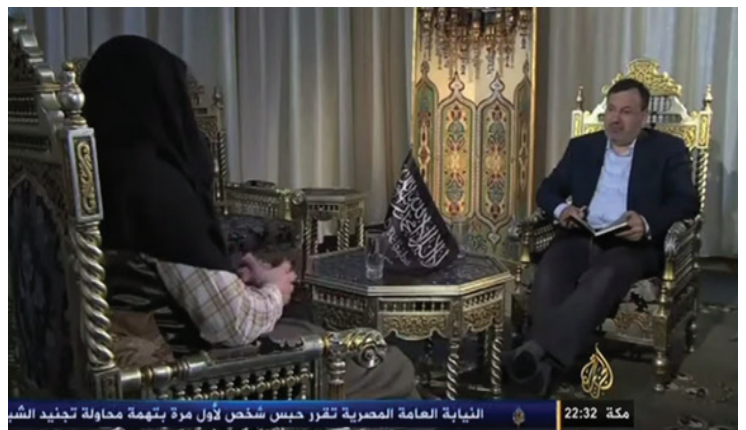
Al-Jazeera interview with JN Leader al-Joulani (May 27, 2015)

nonetheless provide Zawahiri with new options to replace Wahayshi or otherwise absorb his death if Zawahiri is willing to depart from past traditions. Even though these commanders do not have the same set of credentials as typical al-Qaeda leaders, many of them fought U.S. forces during the 2003-2008 Iraq War or in Afghanistan after bin Laden's initial resistance in Tora Bora. These individuals offer Zawahiri a promising source of future leadership within al-Qaeda because of their battlefield experience and, in many cases, their demonstrated commitment to fighting the U.S. Because some of these commanders have extensive regional networks, they